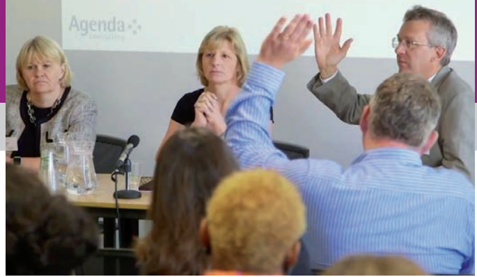
Results Conference and Product Training Workshop

"We have found taking part in the People Count study very useful for benchmarking. The training day was excellent in setting context and thinking about ways of using the statistics with management."